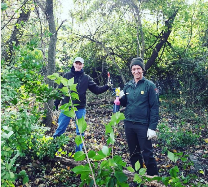
A FOTRI volunteer assisting NPS during a recent Weed Warriors event to remove invasive species

Theodore Roosevelt Island is 88.5 acres of hard work. FOTRI is very appreciative of all the volunteers that helped make the NPS Birthday Event such a great success. We are always looking for additional help to promote the island and put on great events. Current needs include Weed Warriors, communications, docents, and development. Please send an email to info@theodorerooseveltisland.org with your area of interest. As is often the case, President Roosevelt said it best: "Far and away the best prize that life has to offer is the chance to work hard at work worth doing." Our next on-island volunteer event is a Weed Warrior Certification Training on December 3, 2016. Visit our website for more information.